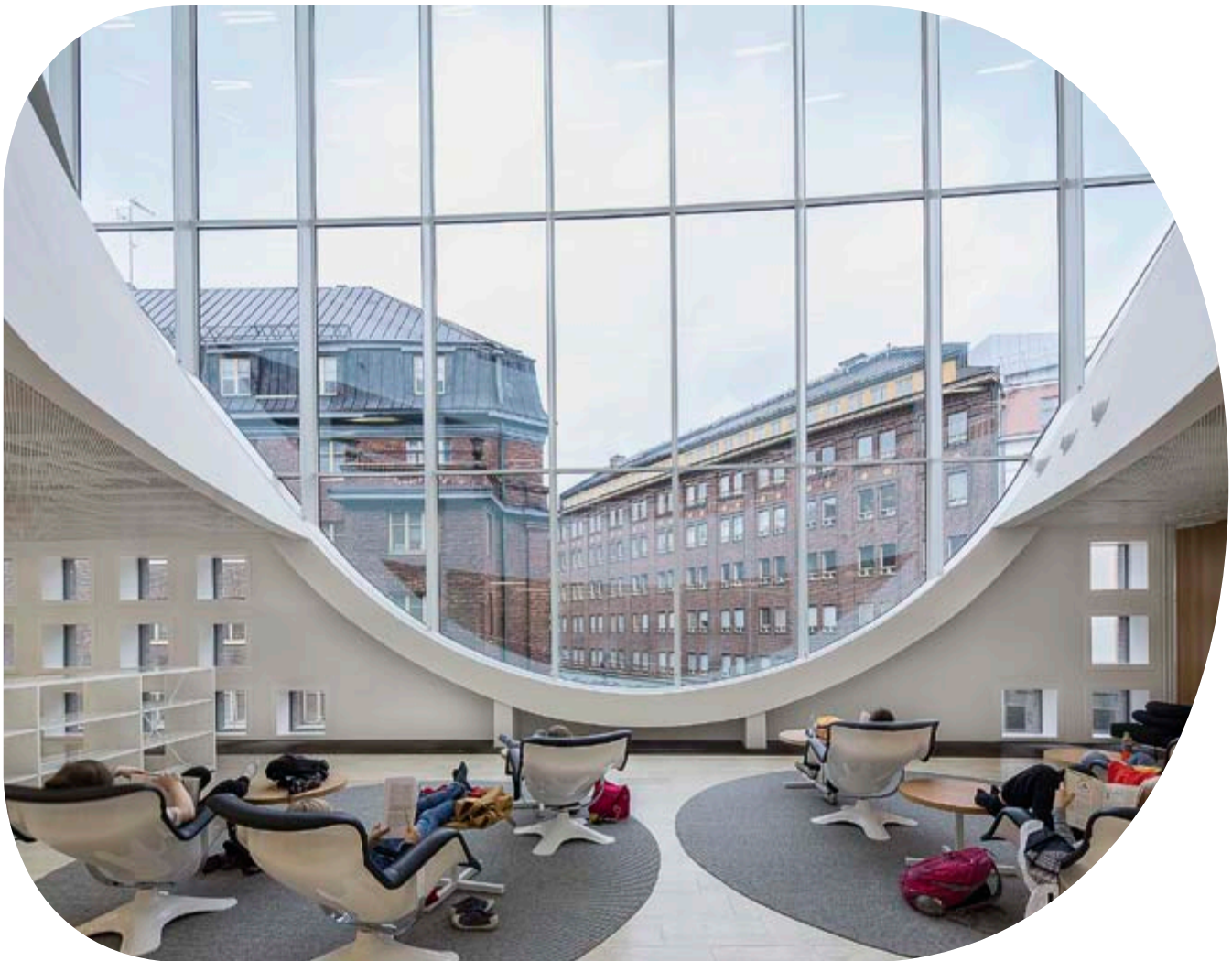
Helsinki University, Finland

For the full range of noise control products visit www.pilkington.co.uk/noisecontrol