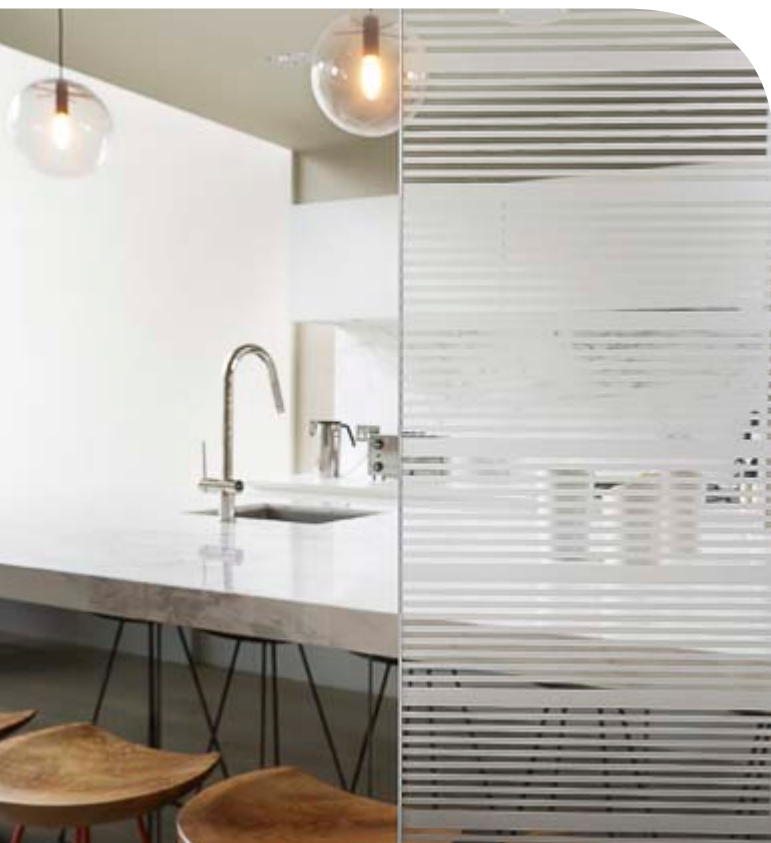
Pilkington Oriel Collection – Linear™