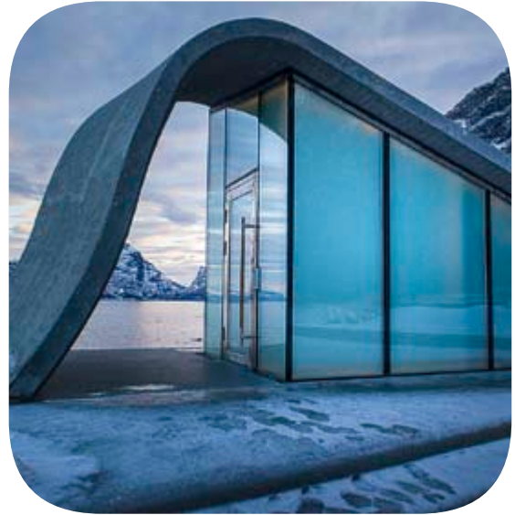
Ureddplassen, Bodo, Norway

Pilkington Optilam ™ offers optimum protection for people and property. For safety, security or noise control, it remains intact and in place after accidental impact, reducing the possibility of injury or restricting access after deliberate impact. Pilkington Optilam ™ is produced by combining two or more sheets of glass with PVB interlayers. By varying the number of layers and thickness of the glass, increased levels of security can be obtained.