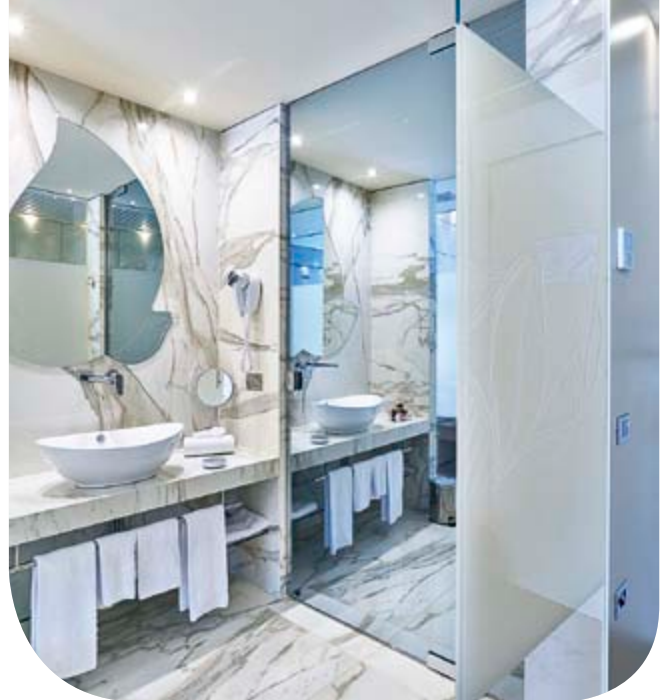
Park Hotel Imperial, Italy

The Pilkington Mirropane™ Chrome family also includes Pilkington Mirropane™ Chrome Plus; a more opaque version when compared with the original Pilkington Mirropane™ Chrome and is ideally suited for applications where no light transmittance is required.