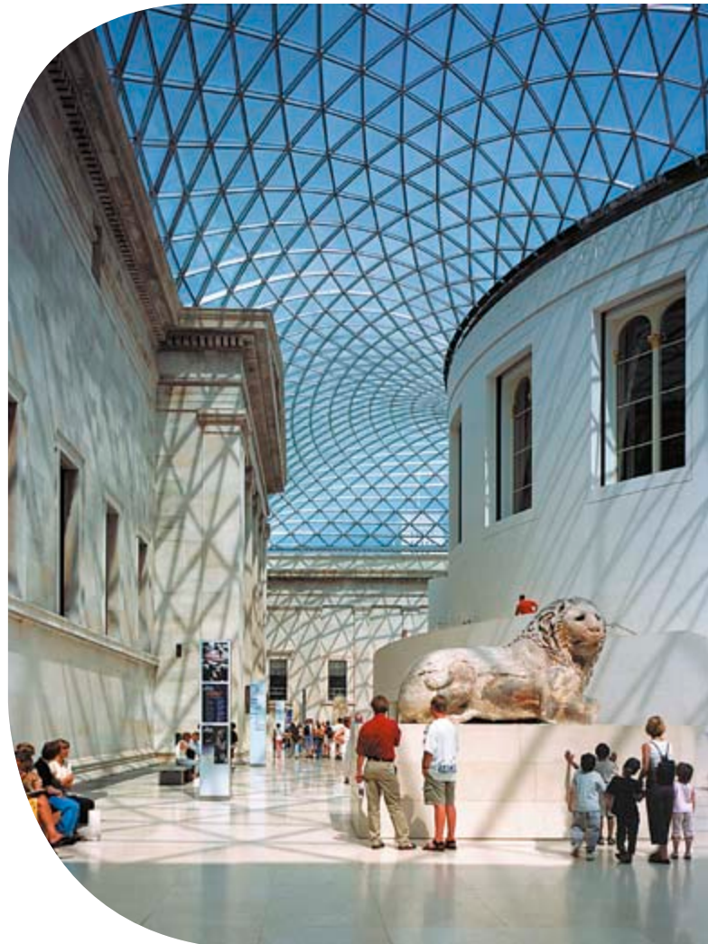
The Great Court at The British Museum, London