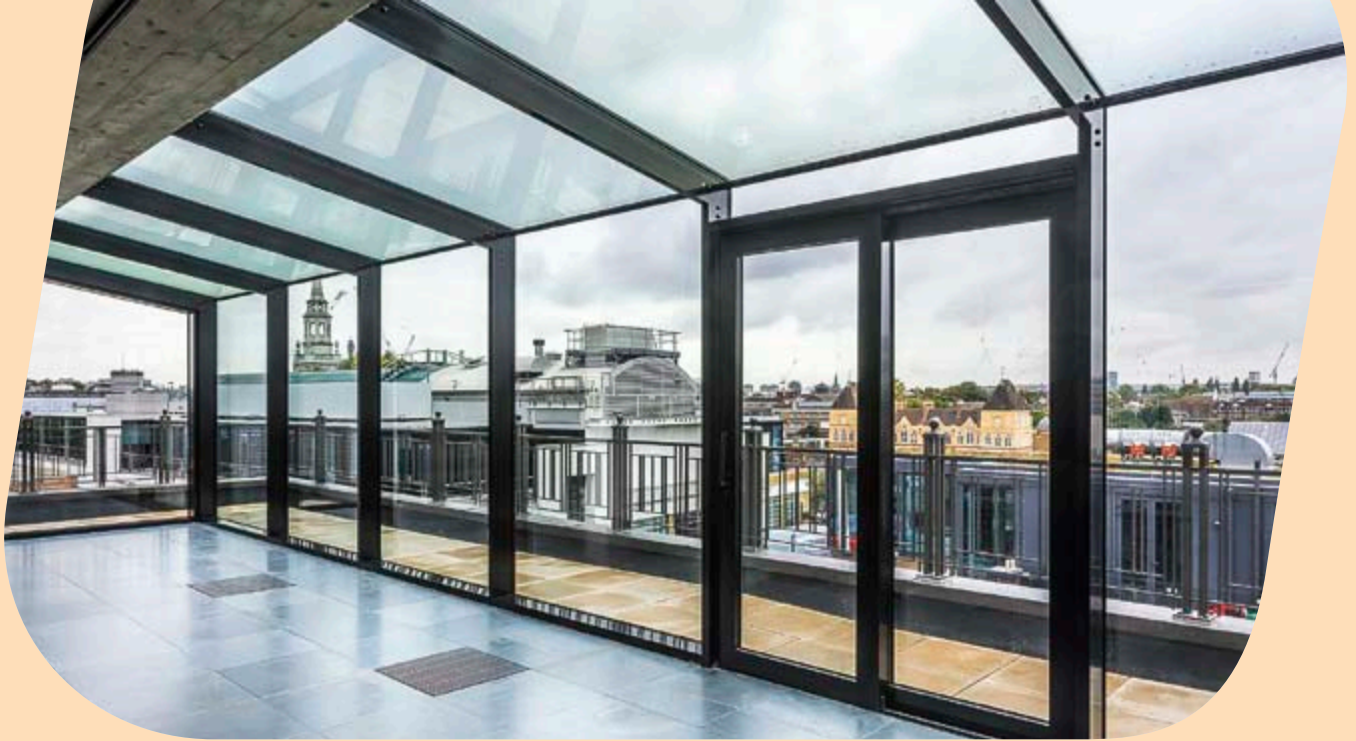
1 Aylesbury Street, London