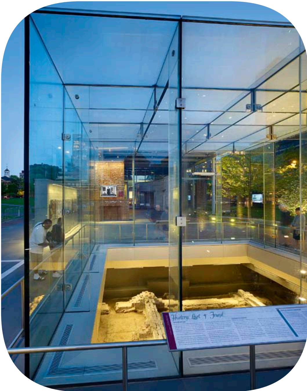
The Presidents House, Philadelphia, USA