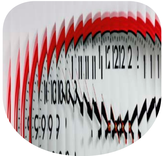
Pilkington Texture Glass – Reeded™

An exciting range of stunning high-end decorative etched glass designs offering excellent light transmission in combination with various levels of privacy. Each of the original eight designs offer a modern opaque appearance.